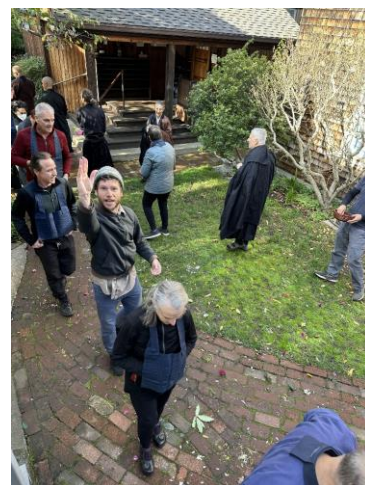
Buddha's Enlightenment Ceremony (December 9, 2023)