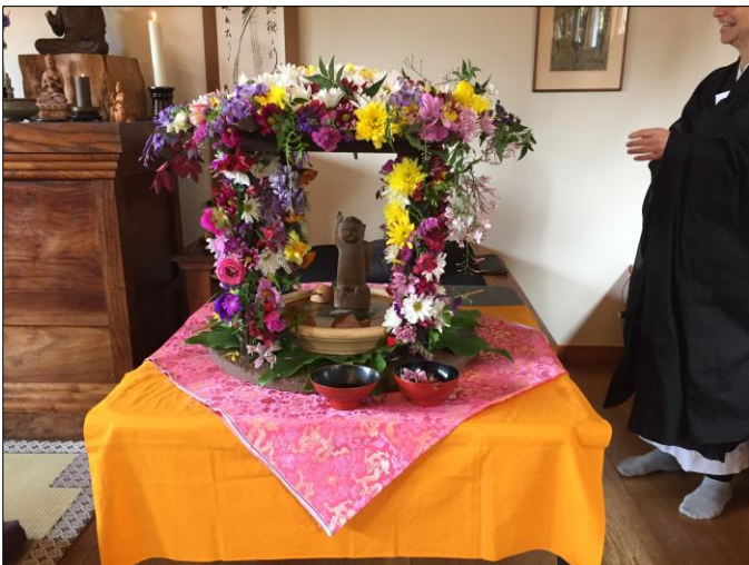
Buddha's Birthday Party Prep