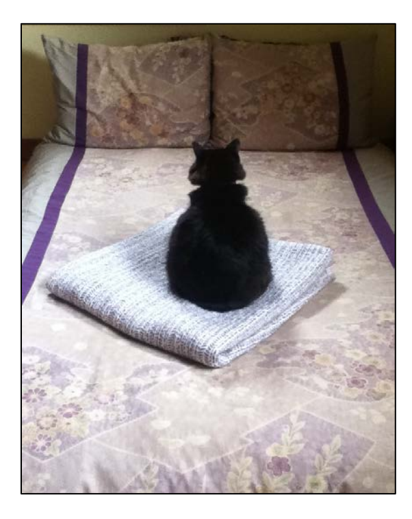
Rocky contemplates the story of Nan-ch',an cutting the cat in two. Not amused, he vows to sit until Nan-ch',an apologizes. - Ross Blum