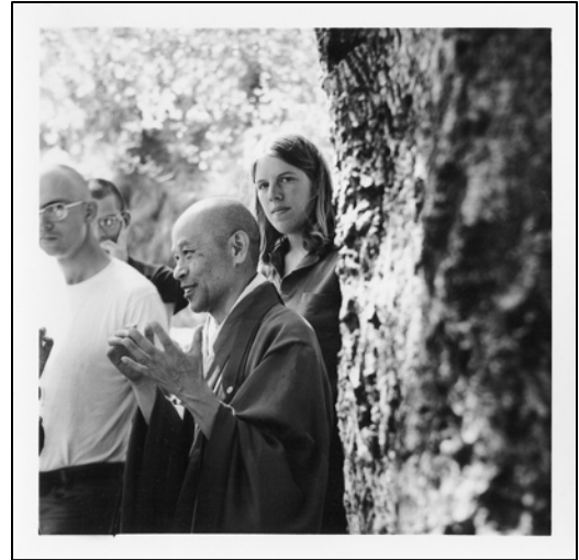
Suzuki Roshi with students, 1967 or 1969.

When we come to practice we have to put some limitation on our life. It's like a bowl of water. If you put water into a flat dish it doesn't have much depth, but if you have a nice deep bowl it will hold a lot of water. It has form and some shape to it. Practice has to have some form and shape. It can hold some deep water and when there are turbulent waves on the surface there is a ballast of calm deep water. This is one of the things that people struggle with in our society because there is so much opportunity, and it keeps us strung out. The things that only a king would have had in the past, every one of us has the opportunity to have today. It's amazing. The kings were some of the most distraught people because they had so much and had to protect it. It's hard to put limitations on ourselves but necessary. If we want to practice, we have to put some limitation on our activity which can be a big relief because then we don't have to run after everything we see. We don't have to own everything that's advertised. One TV might be enough.