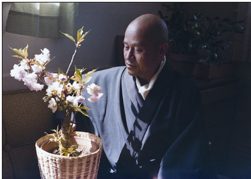
Shunryu Suzuki Roshi