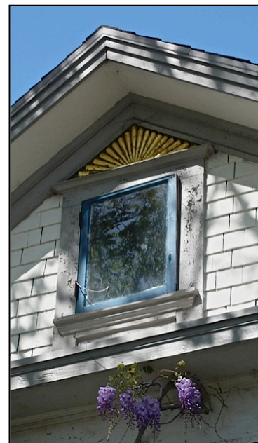
This window at 1933 won't fully open or close.

Exterior walls of the zendo and dokusan hut are showing signs of wear.