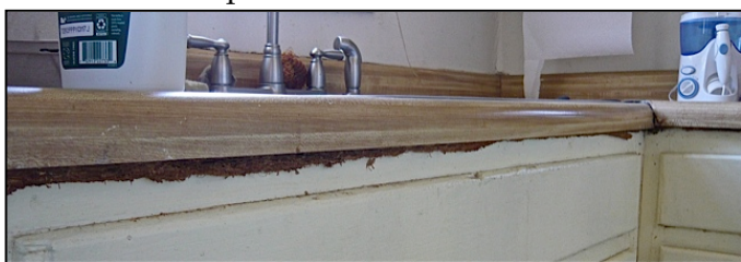
Crumbling countertop in 1929A.

BZC's project management team periodically reassesses our maintenance priorities to determine which needs are most critical, estimate the cost of repairs, and identify which jobs are best handled by professionals and which tasks can be accomplished by sangha members. The team is in the midst of that assessment process now for 2014.