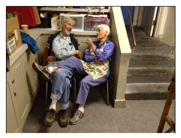
A quiet moment between cooking and serving the men's shelter dinner