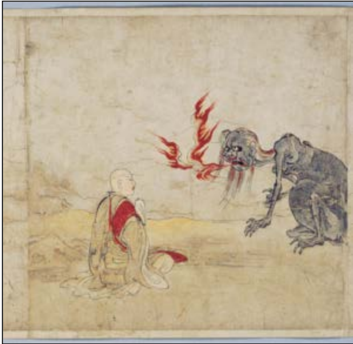
Ananda teaching a hungry ghost. Late 12th century. From the Hungry Ghosts Scroll, Kyoto, Japan.

Sejiki is a popular Buddhist festival that highlights the connections between our world and the world of spirits. At BZC, we offer it as a sort of Buddhist Halloween. The ceremony is a mixture of spooky and solemn—there will be costumes and noisemakers, but we will also recite the names of departed friends and family and make offerings to appease our own hungry ghosts.