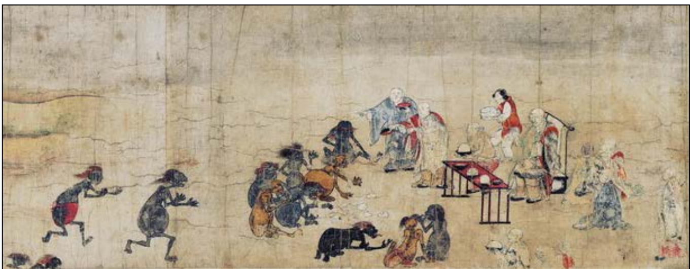
Monks offering food and drink to the spirits of the dead. From the Hungry Ghosts Scroll, Kyoto.