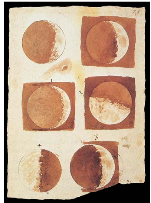
Galileo Galilei, Moon Phases, 1616

When we survey the cosmos, we see an infinite variety of circular forms. We experience the cycles of the seasons and the cycles within the cycles within the cycles and we realize that each one of us is the place where heaven and earth meet. We can also see that circles of energy emanate from us and mix and overlap with those of others. What kind of vibe do we want to send into the world? The way we think and act has an effect. To sit upright in the center of the empty circle as a vehicle for light is the Zen student’s life. The cycle of continuous practice, of sitting zazen and allowing that selfless freedom to be expressed in daily life is the turning of the wheel and the basis for harmony.