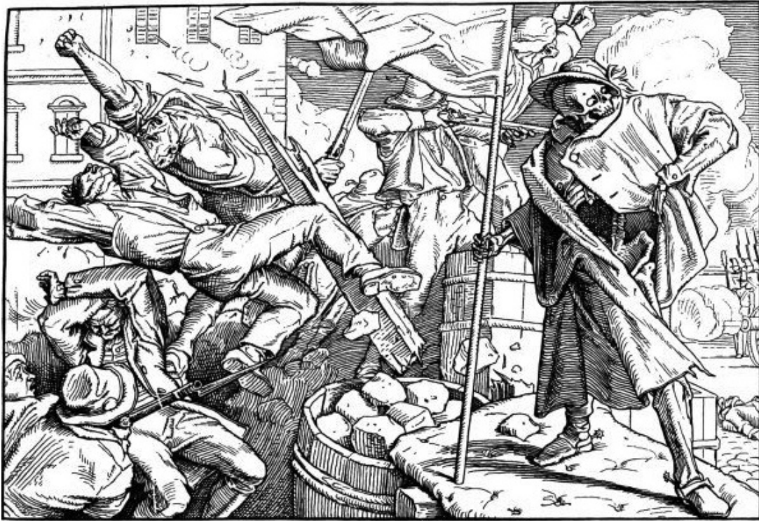
Alfred Rethel, Dance of Death , 1848

This drawing by Alfred Rethel, from 1848, has held my attention for a long time. It needs no words to convey its timeless message. But I do want to say a few words in response, given that it expresses so eloquently the strong pull of the insanity of our time, driven by ignorance and the evil urge.