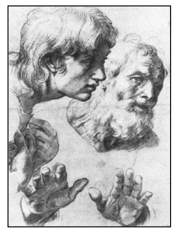
Rafael, Apostles, 1519