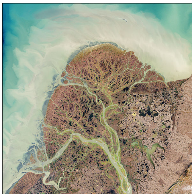
Yukon Delta.

Darkness within darkness. The gateway to all understanding.