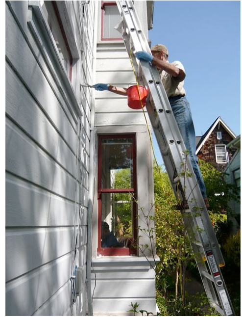
Ladder day saint