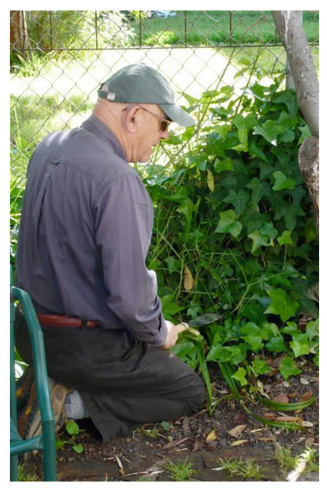
Cultivating the wild ivy

Holding a stinging bee inside the sleeve trees full of leaves shake the wind only the eyes move.