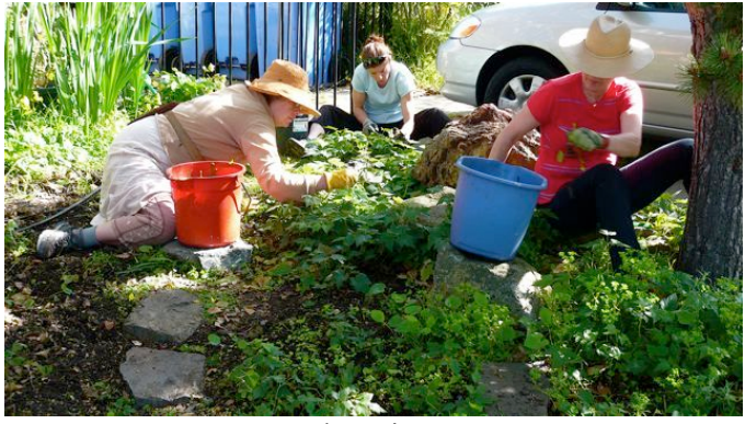
Weeds spring up