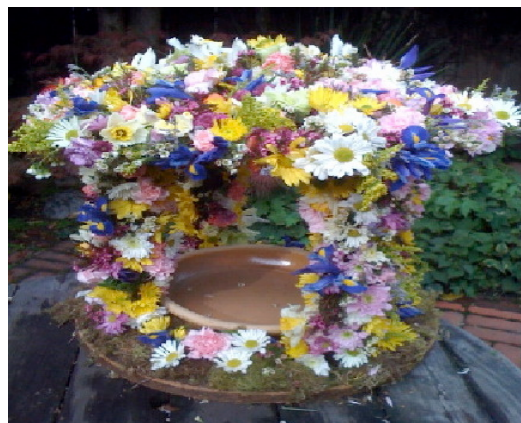
Baby Buddha Bower